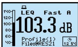
Main result in one-profile view

**with USB 1.1 Host function not active and backlight off