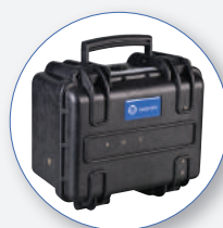
SB 272 External 33 Ah Battery to Monitoring Station