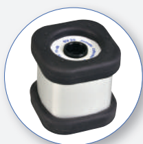
SV 36 Class 1 Acoustic Calibrator 94 dB / 114 dB at 1 kHz