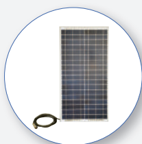
SB 271 Solar Panel to Monitoring Station