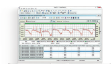
SvanPC++ EM Post-processing software