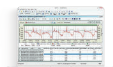
SvanPC++ EM Post-processing software