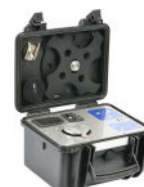
SV 111 Vibration Calibrator