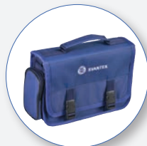
SA47M Carrying Bag Fabric Material