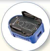
SA104-1 Docking Station for Single Dosimeter