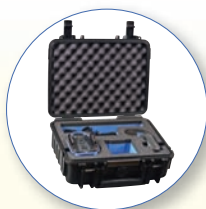
SA147 Waterproof Carrying Case for Noise Dosimeter and Single Docking Station