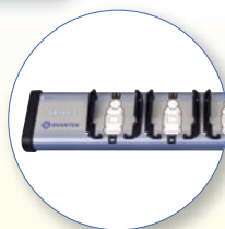
SA104-5 Docking Station for 5 Dosimeters