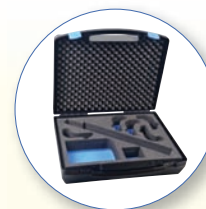
SA144 Carrying Case for 5 Dosimeters and Docking Station for 5 Units