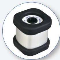
SV 36 Class 1 Acoustic Calibrator 94 dB / 114 dB at 1 kHz