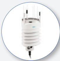
SP 275 Weather Station based on VAISALA module