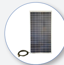
SB 276 Solar Panel to Monitoring Station