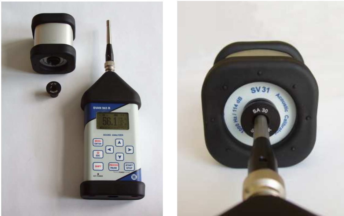
Picture 3. Calibration of the SVAN 943B sound level meter with a ¼” measurement microphone