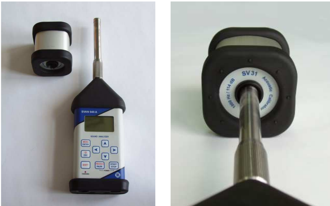
Picture 2. Calibration of the SVAN 945A sound level meter with a 1/2" measurement microphone

The SV 31 is designed for calibration of sound level meters with 1/2" and 1/4" microphones. Picture 2 shows the calibration procedure of Type 1 sound level meter SVAN 945A with a 1/2" microphone.