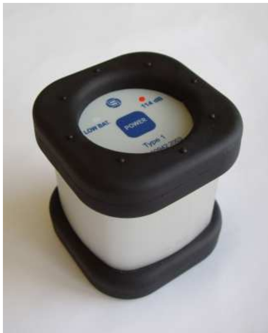
Picture 4. The top view of the SV 31 calibrator with one burning diode