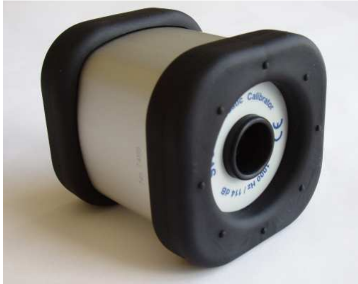
Picture 1. Acoustic calibrator SV 31

The SV 31 is designed for calibration of sound level meters with 1/2" and 1/4" microphones. Picture 2 shows the calibration procedure of Type 1 sound level meter SVAN 945A with a 1/2" microphone.