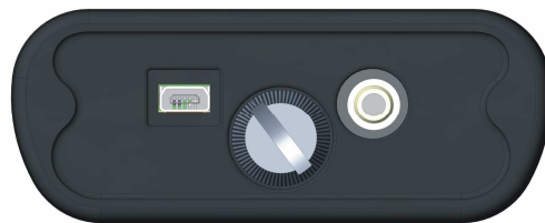
Bottom cover of the SV 102 instrument in 1:1 scale

In the bottom cover, there are two sockets: USB and I/O . The clamping screw is located between the two sockets.