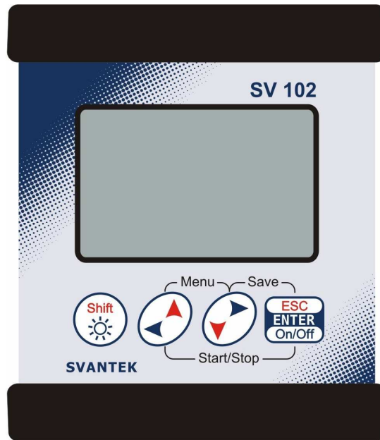
Front panel of the SV 102 instrument in 1:1 scale