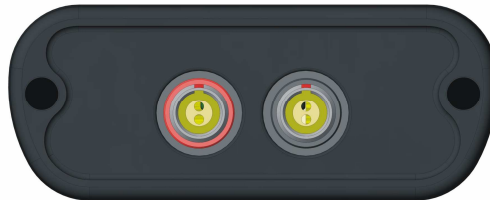
Top cover of the SV 102 instrument in 1:1 scale

The microphone inputs are placed on the instrument's top cover. In the case of one-channel operation, the user should use left microphone input. The user should plug Lemo connector until it clicks. The full description of the signals connected to the sockets is given in the Appendix C.